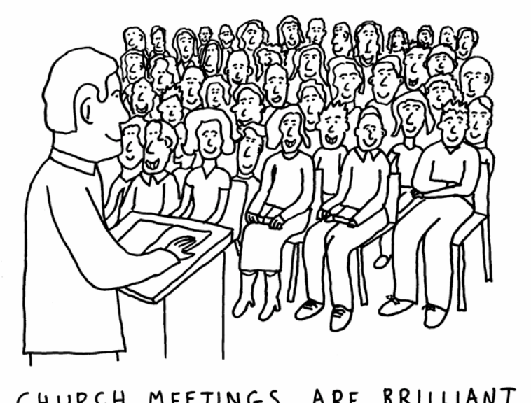
ARE BRILLIANT CHURCH MEETINGS

So, our meeting today will take place during our service, and therefore in the context of worship and prayer. Be ready to give thanks to God for all the many good things happening in the life of St. Peter's – and be ready too to pray for the significant challenges that we face.