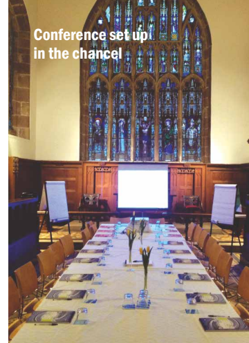
Conference set up in the chancel

'Thank you so much for all your help and assistance. The event went really well and everyone enjoyed it, not just the programme but the location and the church, they all said how wonderful it had been'