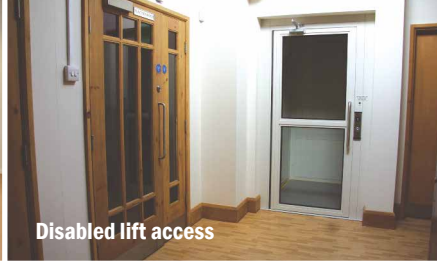
Disabled lift access