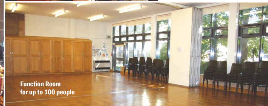
Function Room for up to 100 people