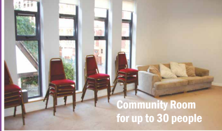
Community Room for up to 30 people

Our dedicated staff will greet your delegates, and are on hand for any other requirements you may need. We can provide projector, flip charts, and all our meeting rooms have several power points for your convenience. Wifi is free throughout the venue. As well as light refreshments, we can supply a catered lunch at a competitive cost.